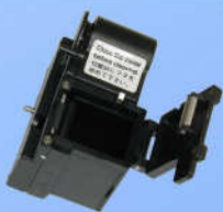
CU-FC6 offcut collector