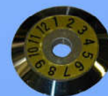
FCP20-BL cleaver blade